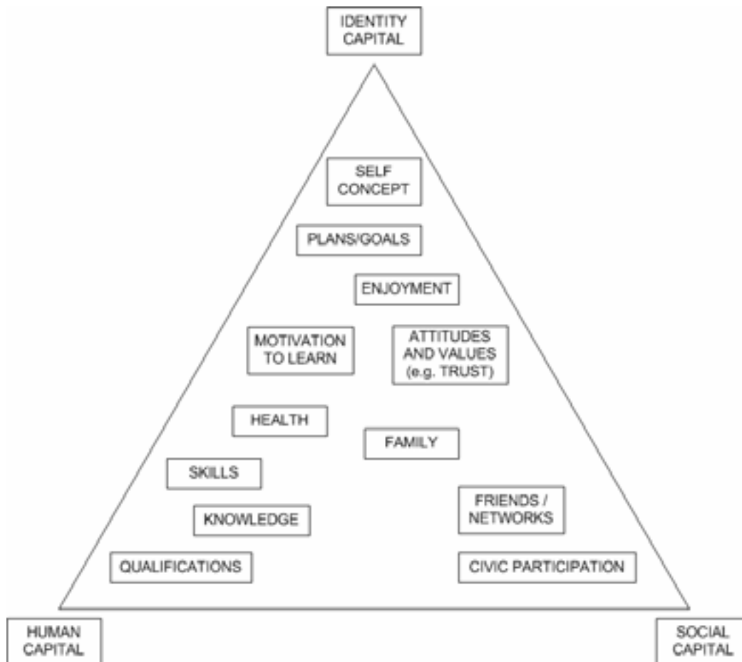
Figure 1: Conceptualisation of the wider benefits of learning (Schuller et al. 2004, p.13)

The items in the triangle in Figure 1 are both outcomes of learning and ‘capabilities’ allowing for further development and benefits. While some are more closely related to one of the three forms of capital, e.g. self-concept to identity capital, the outcomes are not conceived as fixed in their distance from the particular pole or their relationship to each other, and the whole framework is essentially dynamic in nature. Learning is likely to have multiple outcomes, it is ongoing, interactions between outcomes are complex and it is possible to explore links between any two or more outcomes.